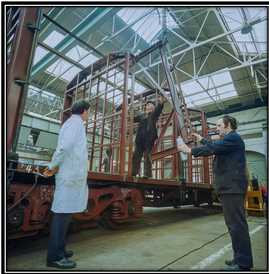
WagonConstruction_1970s_Inchicore_1974_IrishRailwaySociety.jpg Assembling the frame of a new railway pallet van for bagged fertilizer traffic, Inchicore Works, Dublin, circa 1974.