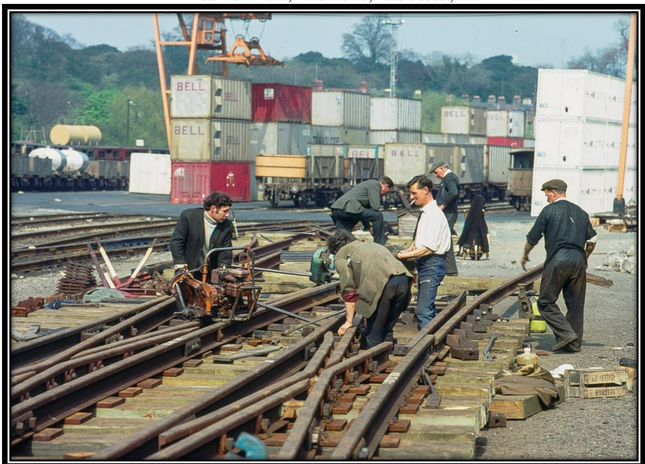
PWDept_1970s_Heuston_Jul_1974_IrishRailwaySociety.jpg Permanent Way Dept. assembling tracks and points at the new freight container yard at Heuston Station, July 1974.