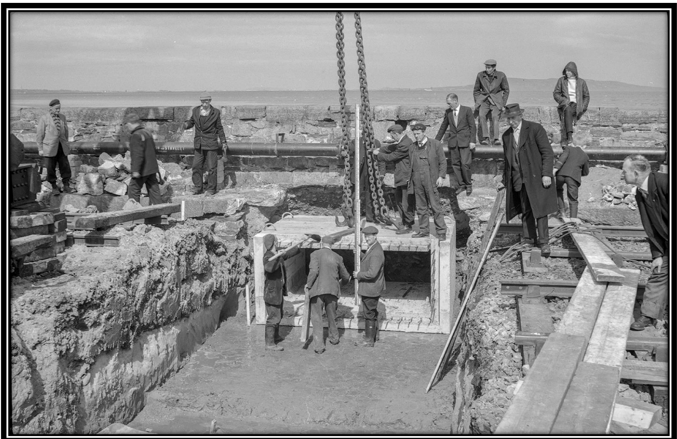
PWDept_1960s_Booterstown_Apr_1968_IrishRailwaySociety.jpg Permanent Way Dept. installing new culvert below the line near Booterstown, April 1968.