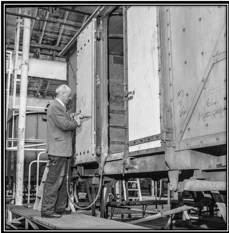
WagonConstruction_1960s_Inchicore_1967_IrishRailwaySociety.jpg Repairing a CIÉ goods van for rail sundries traffic at Inchicore Works, Dublin, 1967.