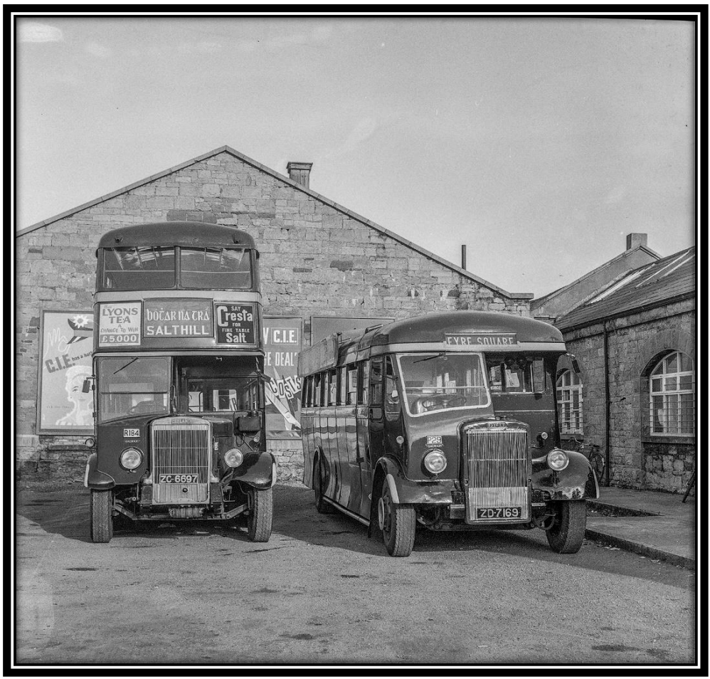
Vehicle_1960s_Galway_June_1960_IrishRailwaySociety.jpg CIÉ double and single decker city buses R184 and P29 at Galway Station, June 1960.