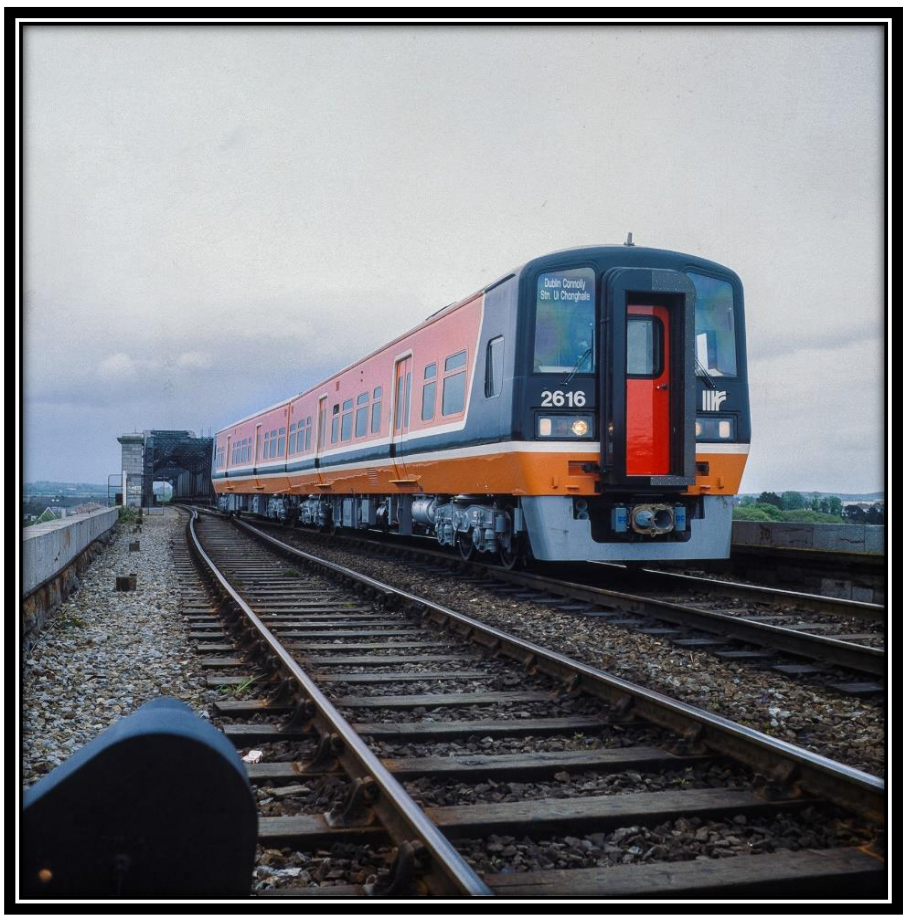
Train_1990s_Drogeda_May_1994_IrishRailwaySociety.jpg Iarnród Éireann new 2600 Class suburban 'Arrow' railcar, pictured on the Boyne Viaduct, Drogheda, May 1994.