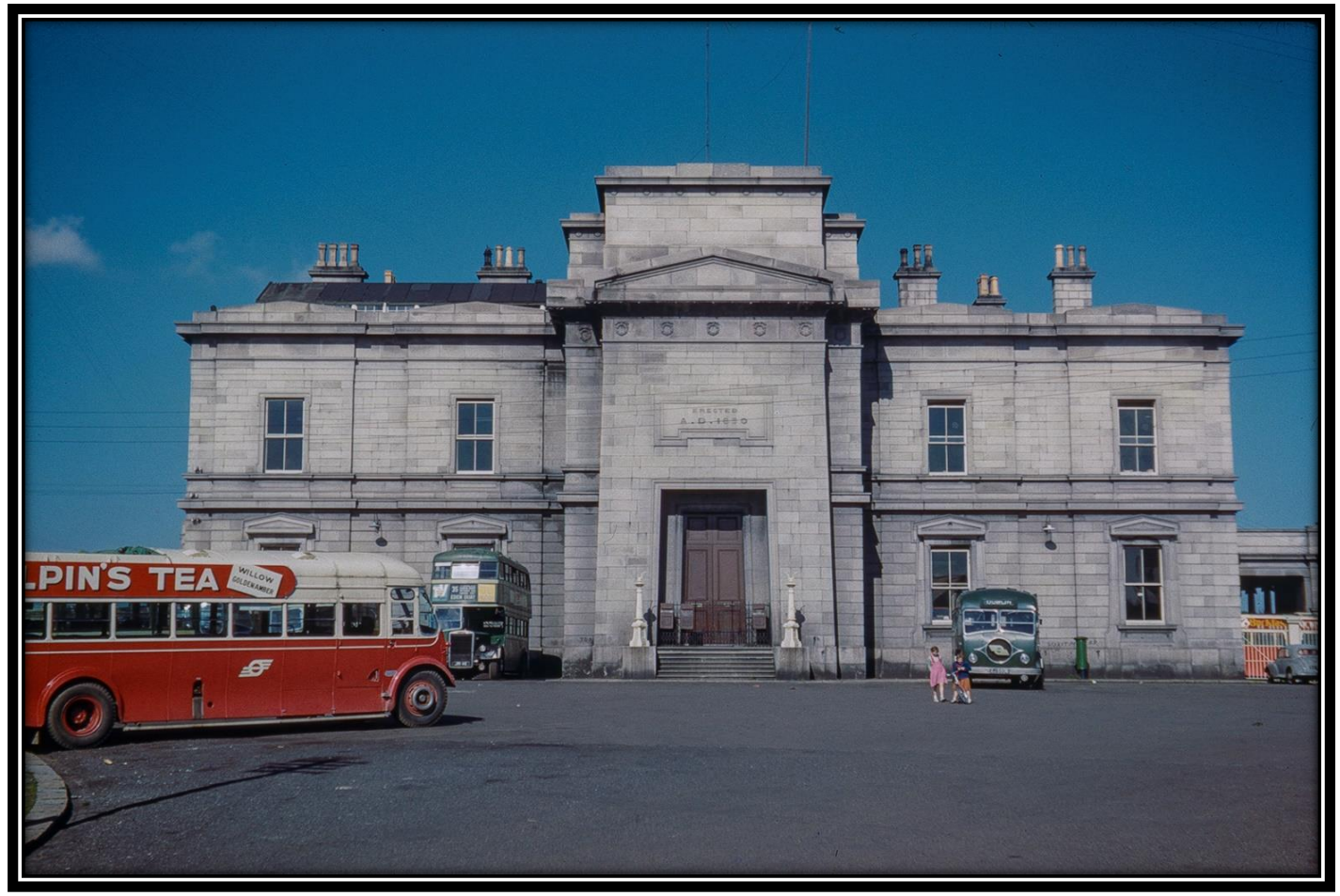
Vehicle_1960s_Broadstone_Sept_1960_IrishRailwaySociety.jpg CIÉ Broadstone bus depot, Dublin, September 1960.