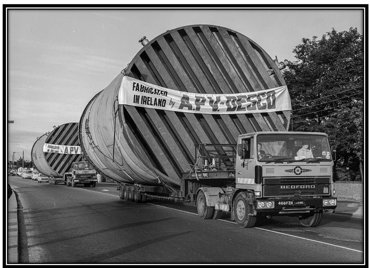
Vehicle_1980s_NaasRd_Jun_1980_IrishRailwaySociety.jpg CIÉ road Freight-Service vehicles with a heavy-load operation conveying new vats for Guinness Brewery, Naas Road, Dublin, June 1980.