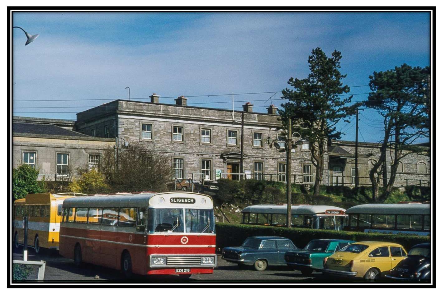
Vehicle_1970s_Sligo_Mar_1974_IrishRailwaySociety.jpg CIÉ school and provincial buses at Sligo Station, March 1974.