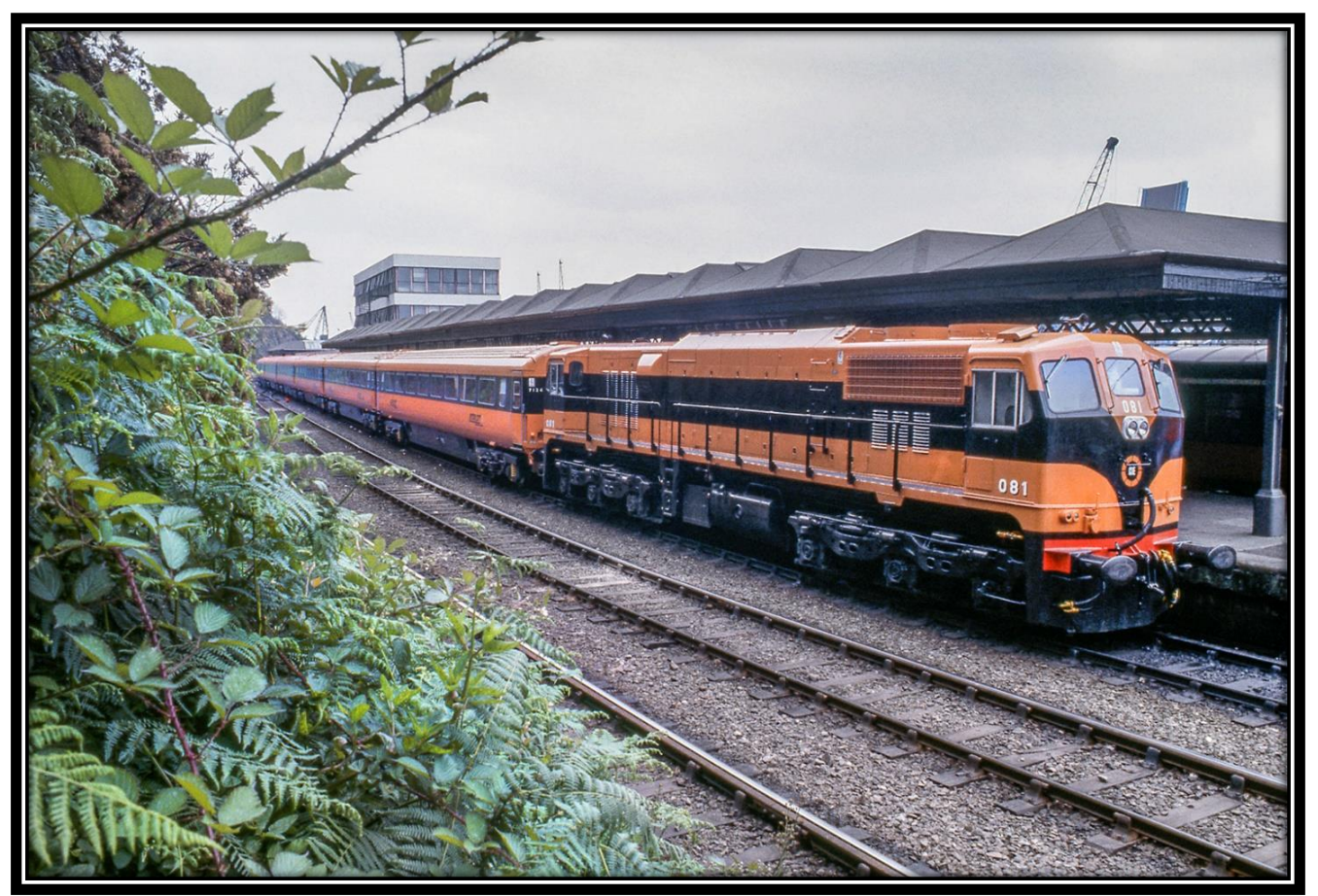
Train_1980s_Waterford_April_1984.jpg New CIÉ Intercity MkIII train pictured in Waterford Station following their introduction in 1984.