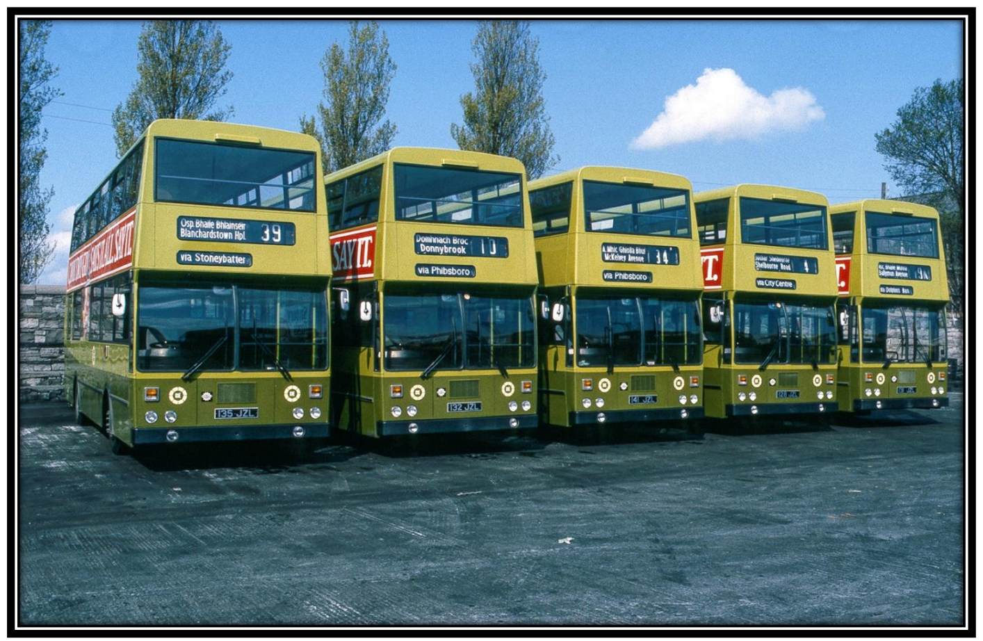
Vehicle_1980s_Broadstone_c1982_IrishRailwaySociety.jpg New CIÉ Bombardier bus fleet at Phibsborough Depot, Dublin, circa 1982.