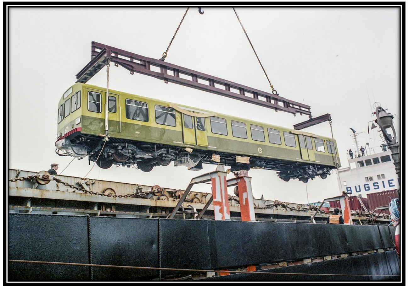
Train_1980s_PointQuay_Nov_1983_IrishRailwaySociety.jpg The first DART train is unloaded at the Point Quay, Dublin, having arrived from the Linke-Hofmann-Busch company in Germany, November 1983.