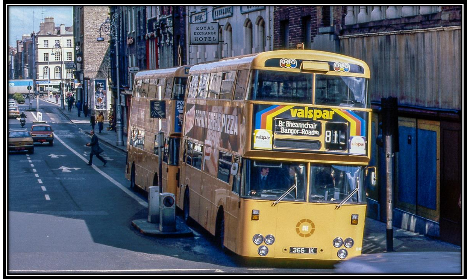
Vehicle_1980s_ParliamentSt_Mar_1980_IrishRailwaySociety.jpg CIÉ Atlantean buses in desert-sand livery on Dublin City's first bus-lane, Parliament Street, March 1980.