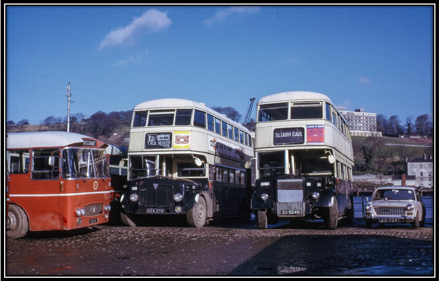
Vehicle_1970s_Waterford_Feb_1971_IrishRailwaySociety.jpg CIÉ Waterford city buses, February 1971.