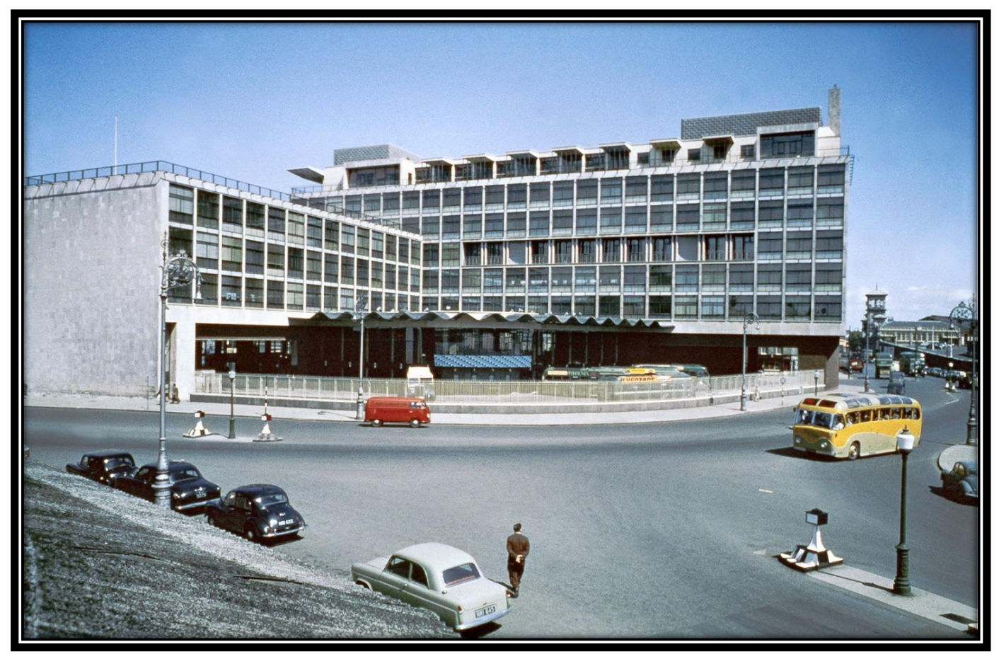
Vehicle_1960s_Busáras_c1961_IrishRailwaySociety.jpg CIÉ Busáras Central Station, Dublin, circa 1961.