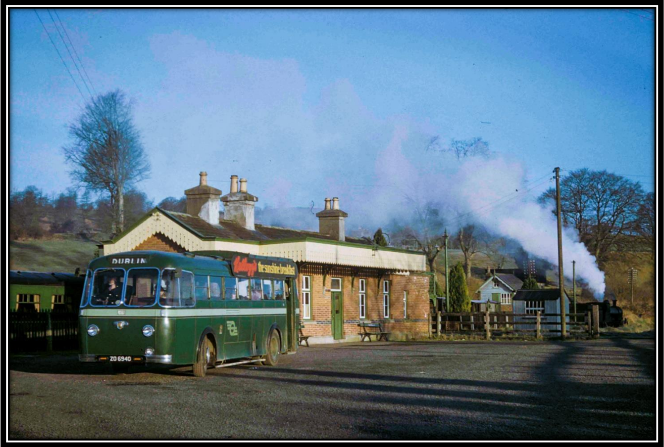
Vehicle_1950s_Baltinglass_Mar_1959_IrishRailwaySociety.jpg CIÉ provincial bus U69 pictured at Baltinglass Station, County Wicklow, on a Dublin-Tullow service.